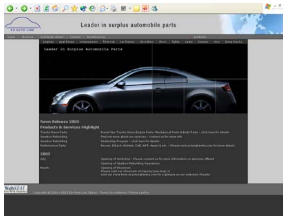
Corporate Website – www.ehautolink.com.my