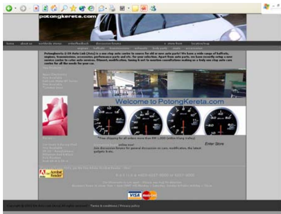
Store Front – www.potongkereta.com