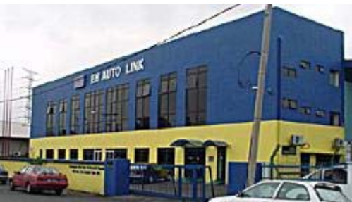
Leader in new surplus auto parts